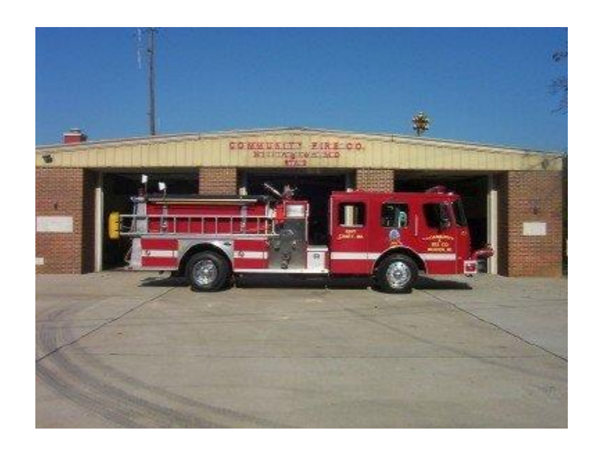
Town of Millington