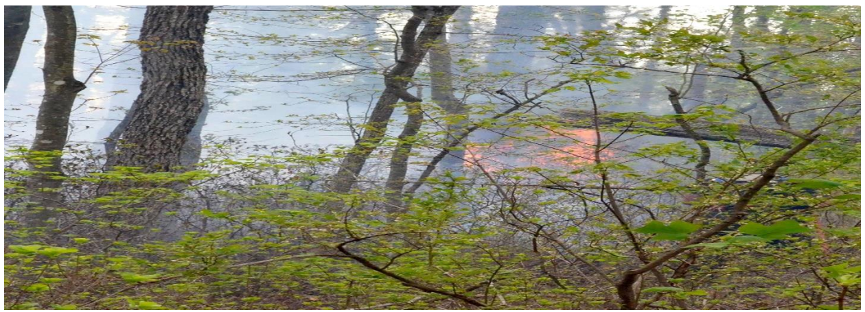
Other considerations are as follows: